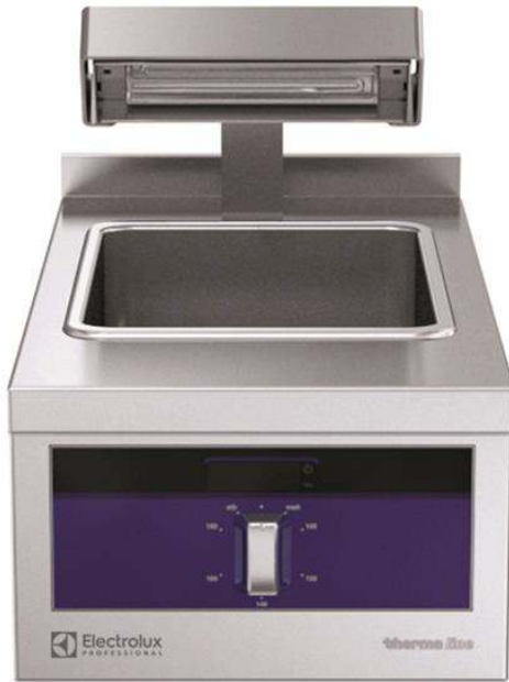
588095 (MAYAABDOBO) Electric Chip Scuttle, one-side operated with backsplash, 1/1 GN